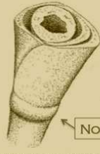
HOLLOW STEM WITH NODES

HINT: SEDGES HAVE EDGES, RUSHES ARE ROUND, GRASSES ARE HOLLOW, WHICH HAVE YOU FOUND?