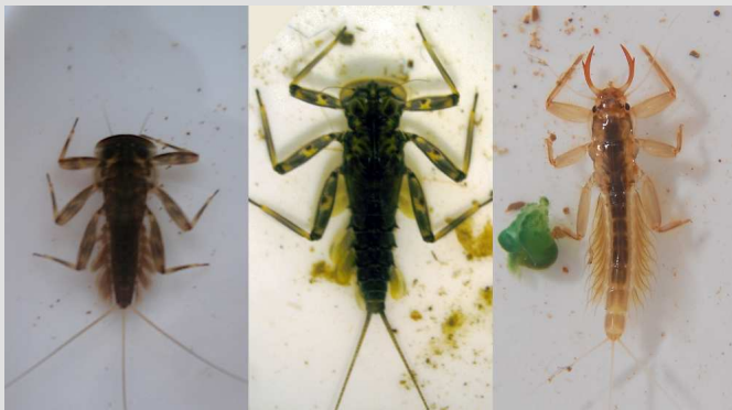
Picasa Nephron, Flickr C. Fungi, Bedwetting in Aus