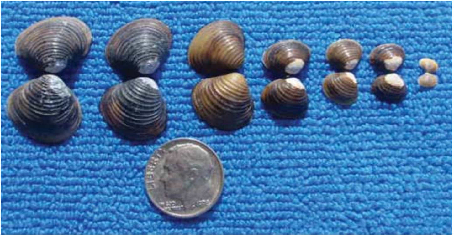
Asian clams can reach the size of a dime or larger in 2-3 years.

Diving, Scientific Diving International, and the Vermont Department of Environmental Conservation as well as researchers from Lake Tahoe.