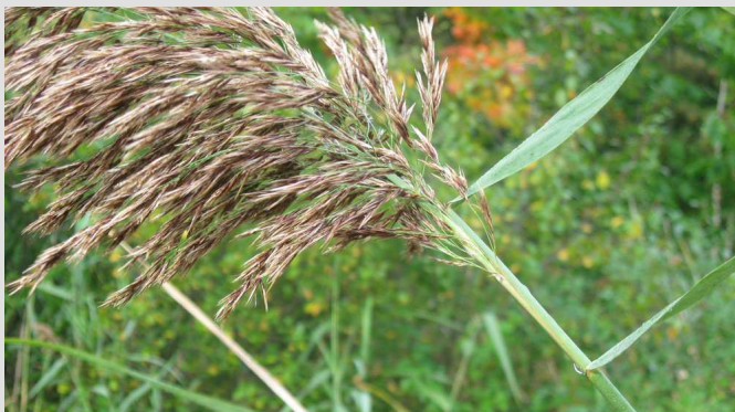
VS user 031, Falmouth Middle School