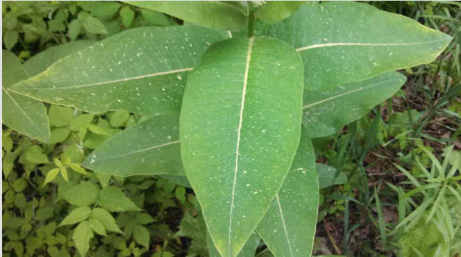
Vital Signs user 72dg6